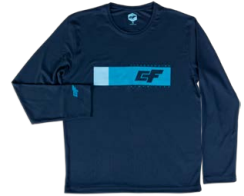
Quick dry jersey Rapid LS Dark Blue