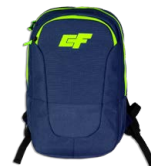
Backpack Lite 50 x 31 x 23 cm