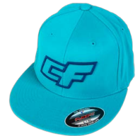
Logo Hat Blue