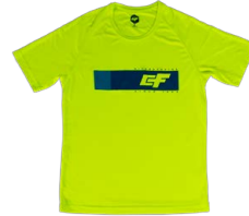
Quick dry jersey Rapid SS Green