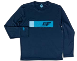
Quick dry jersey Rapid LS Dark Blue