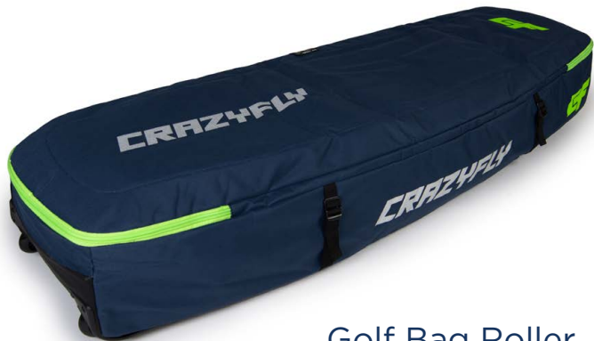
Golf Bag Roller 150 x 45 x 25 cm (with wheels)