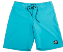
Diamond Board shorts