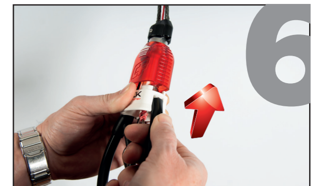
6. This pushes the red part of the quick release up and allows the metal loop to automatically click back into its original position. Now the quick release safety system is ready to use again.

MAKE SURE THAT THERE IS NO SAND OR DIRT INSIDE THE SAFETY SYSTEM. RINSE THE SAFETY SYSTEM WITH CLEAN WATER AFTER EVERY RIDE IF POSSIBLE.