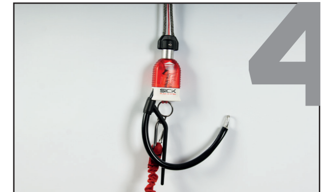
4. Now the chicken loop is opened. This kills rapidly the power of the kite. You are now connected to the kite only via the safety leash, which should also be releasable in a case of extreme emergency.