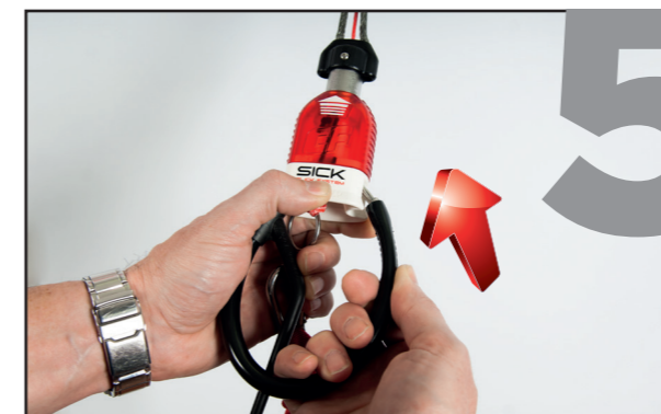
5. To re-assemble the safety system, hold the white bottom part of the quick release in your left hand and push the metal end of the chicken loop by your right hand to the hole in the quick release.