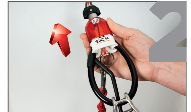
2. In case of an emergency, simply push away the red plastic part of the quick release with CF logo.