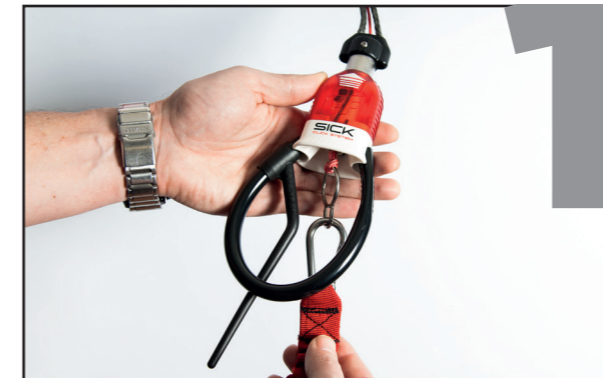
1. Always attach your kite with your safety leash to your harness.