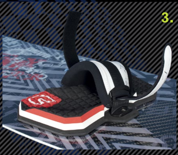
Repeat step 2 on the other side of the strap. Adjust the strap size to your foot.