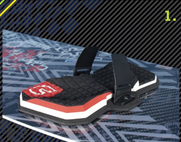
Mount the plastic parts.