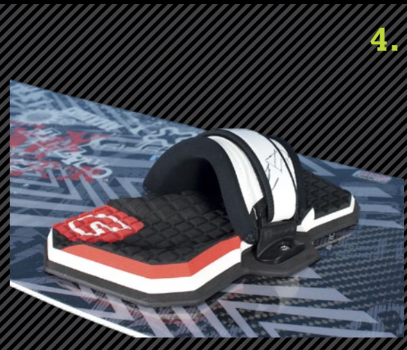
Stick the velcro together with your foot inside. All you have to do now is enjoy your ride.