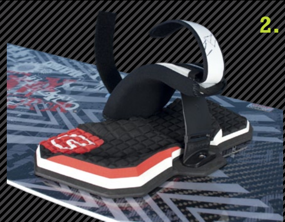
Pass the strap velcro through the plastic part and insert the plastic into the strap tunnel.