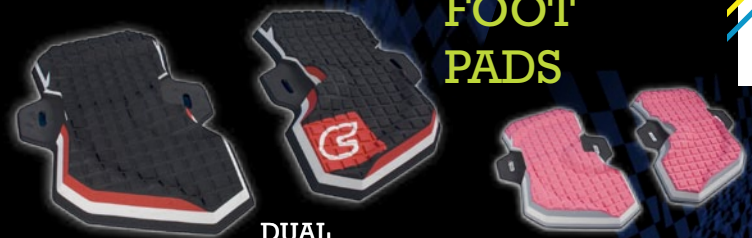
DUAL DENSITY PRO