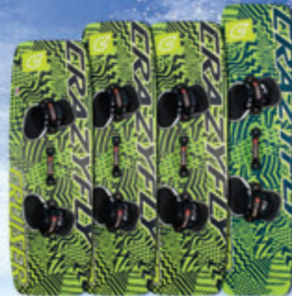
135 x 46 145 x 44 145 x 48 154 x 39