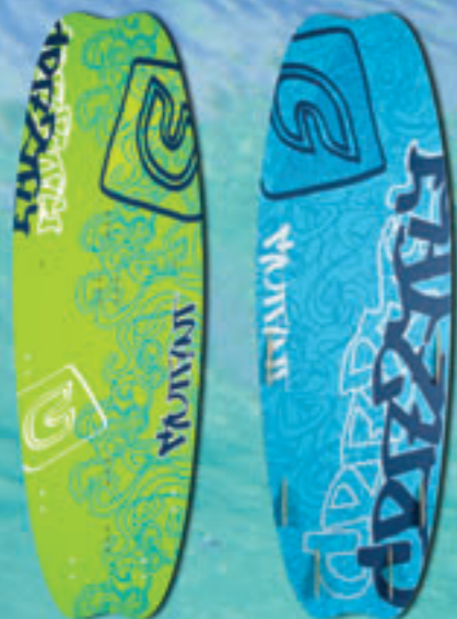
140 x 44