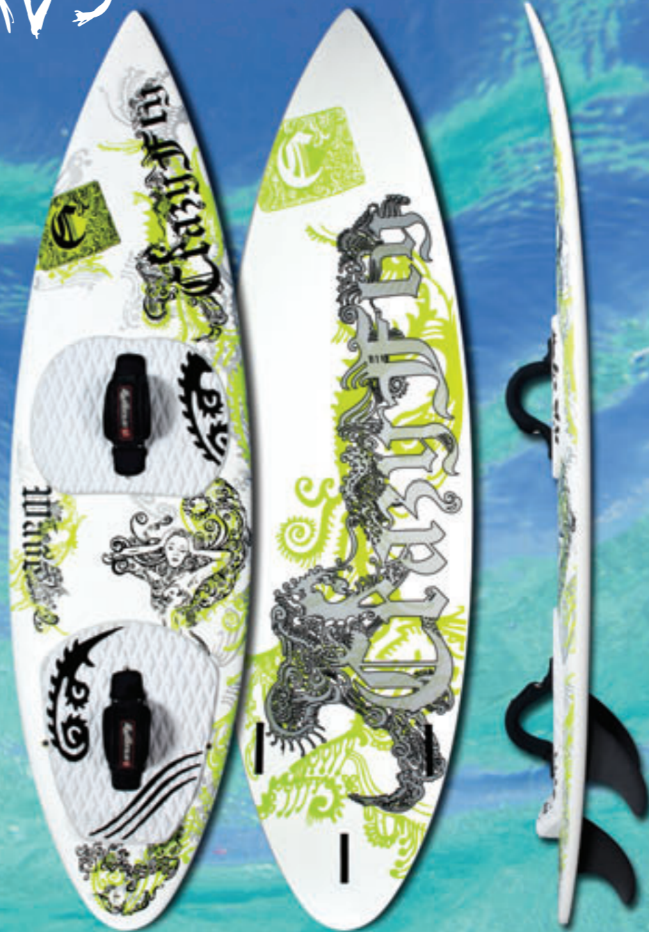
165 x 44