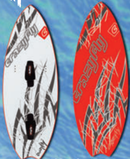
135 x 48