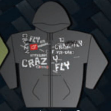
GRAY WITH ZIP