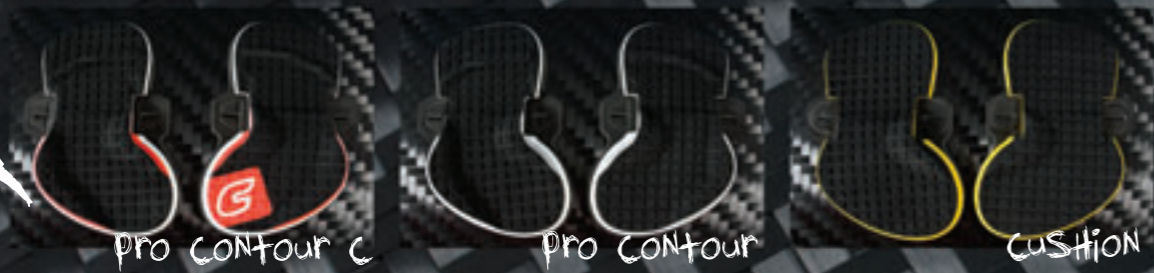
PRO CONTOUR C