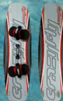
145x41 2.6 kg

Let us present you our all terrain vehicle. Allround is a great board for light wind conditions, suitable for both begginers and advanced riders. Immediate planning, easy control, no difficulty to jump and excellent landing are one of the main characteristics of this model.. If you are looking for your first board, you can not miss it.