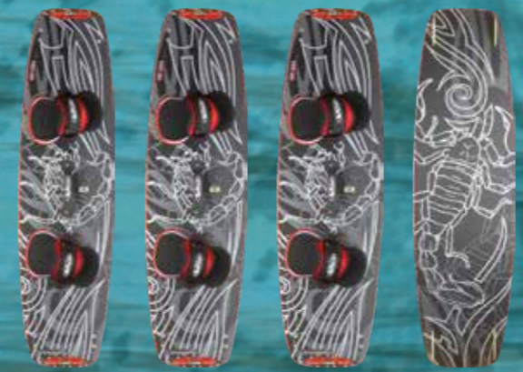
137x37 2.5 kg 137x39 2.6 kg 137x41 2.7 kg bottom