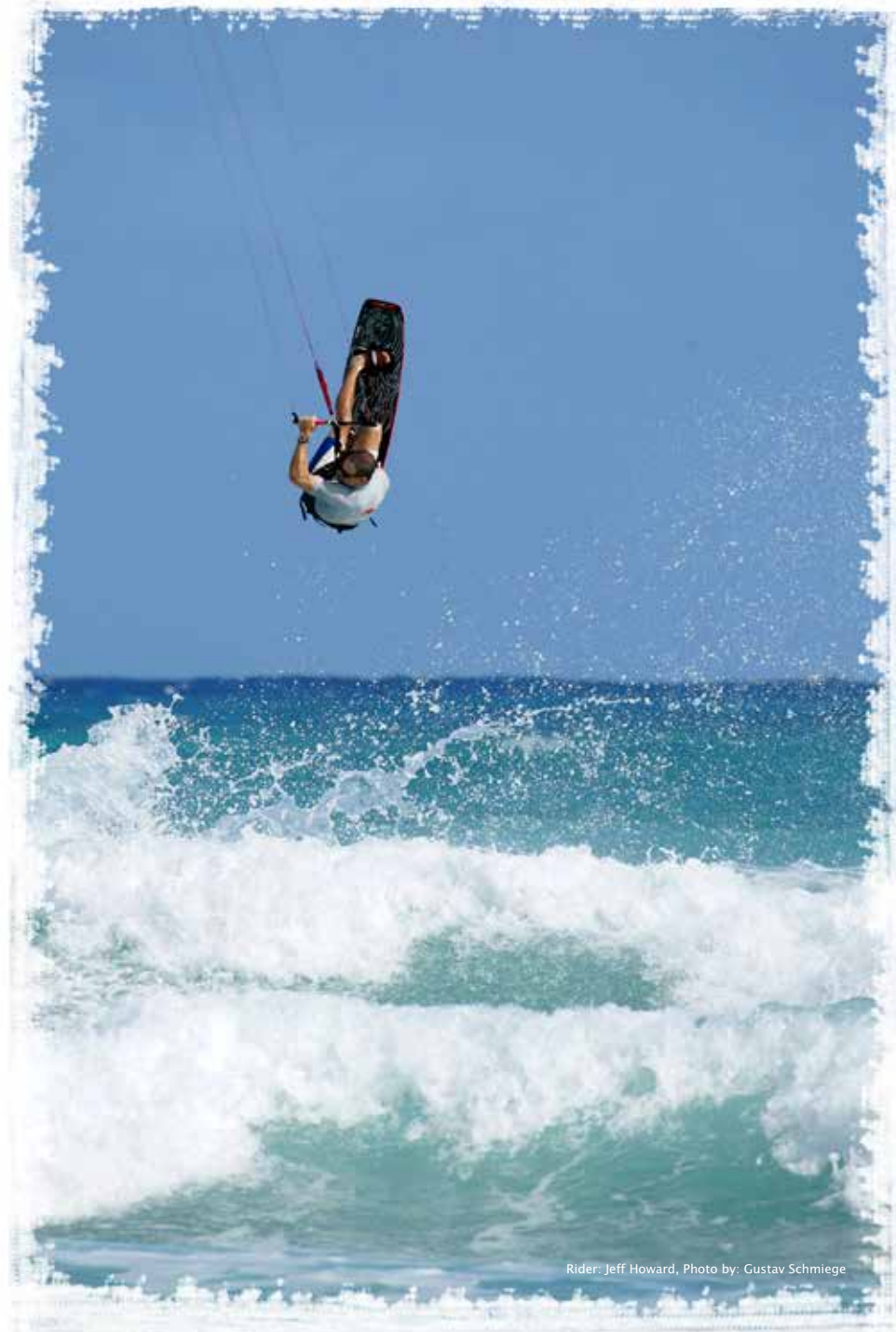
Rider: Jeff Howard

Prokitesurf/Precision Kites tel: 001 361 883 1473 info@prokitesurf.com