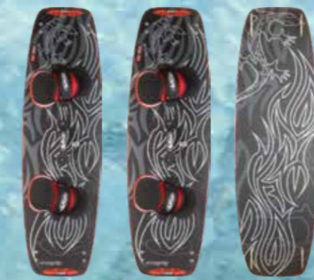
132x39 2.5 kg 132x41 2.6 kg bottom

Another high performance model from our Pro line with outstanding ability to go upwind, early planning in lightwind and easy maneuverability in strong wind. Its unbelievable weight makes you free to do any trick or jumps that you have been always dreaming about.