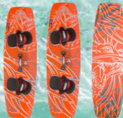
127x38 2.3 kg 132x39 2.5 kg bottom