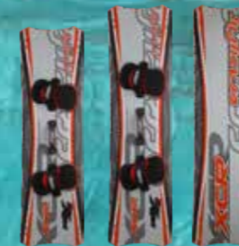
140x41 2.8 kg 154x41 3.3 kg bottom

If wind picks up a bit and others are still sitting on the beach and waiting for more knots, you can take your CrazyFly lightwind board and enjoy immediate planning. XCR make its upwind riding abilities better than ever. This model will find its place in hearts of begginers as well as experienced riders.