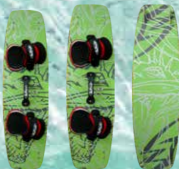
112x32 1.7 kg 116x34 1.9 kg bottom